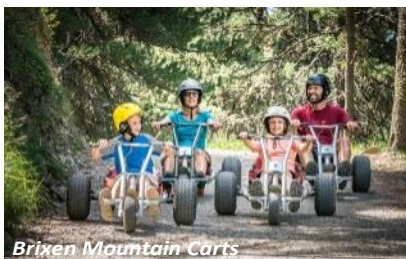
Brixen Mountain Carts