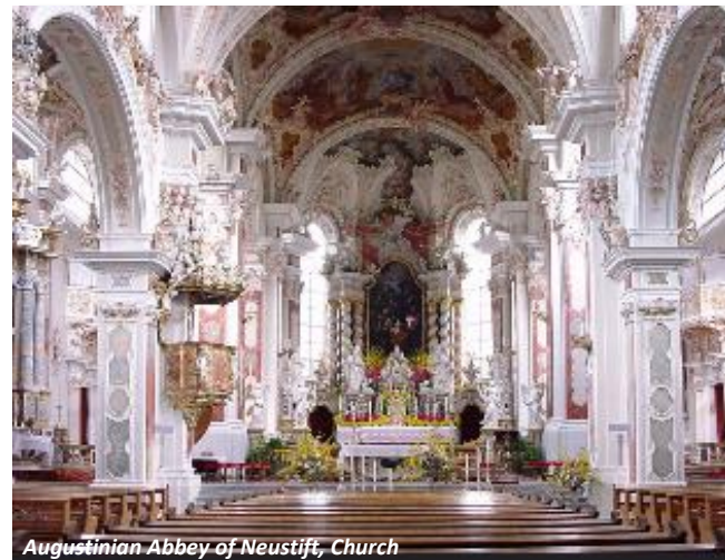
Augustinian Abbey of Neustift, Church