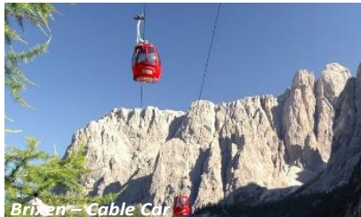
Brixen - Cable Car