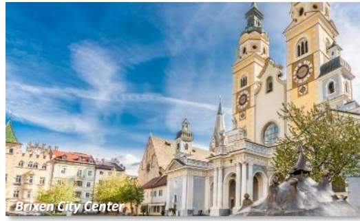
Brixen City Center