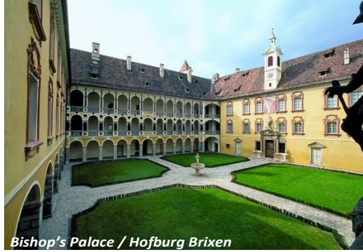
Bishop's Palace / Hofburg Brixen