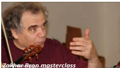
Zakhar Bron masterclass