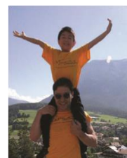
Baruch Meir masterclass