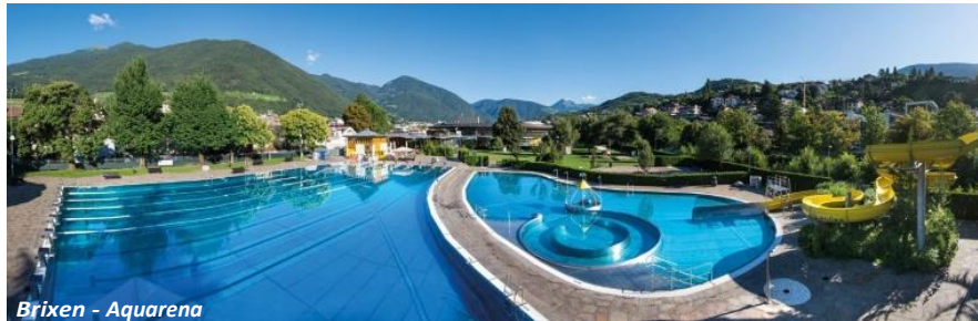
Brixen - Aquarena